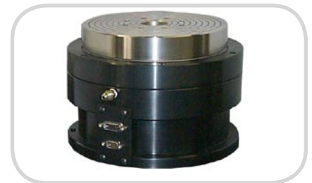
AT - 200 Direct Drive Air Bearing w/ Vertical axis base mounting.

* = Additional error motion specifications available.