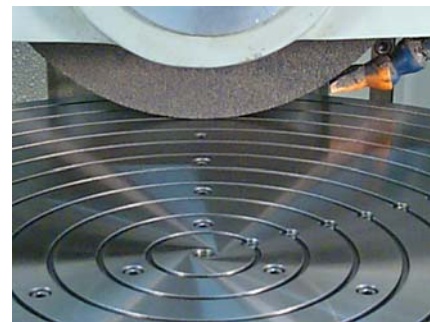
Shown on a 18" x 48" Surface grinder