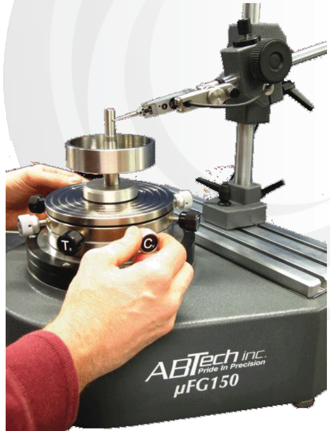
Fine action for leveling and centering the part with ABTech's spherical seat design. Lock in the adjustments using eight opposing knobs to eliminate hysteresis and provide superior position stability.

Don't leave even simple RunOut measurements to operator subjectivity. Quickly print or save a PDF of any of the form measurement results and graphical charts for document traceability. Save the raw data file, or export and share the data with the available network option via an Ethernet connection for use in your existing statistical process control (SPC) program.