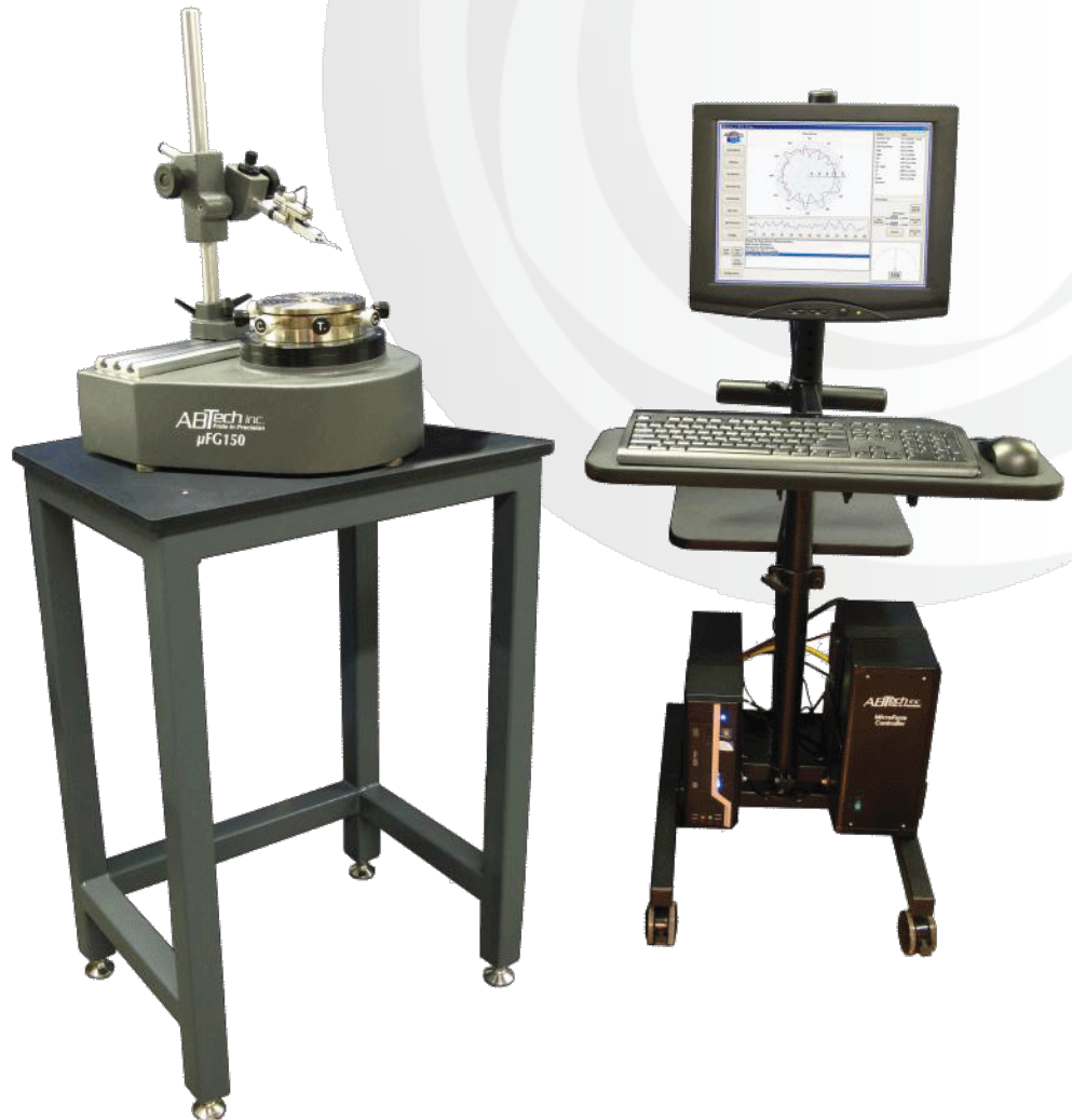
Shown with optional electronics cart and welded steel base for model μFG150 metrology platform

Ask about MicroForm systems for larger air bearing platforms or as an upgrade to your existing system. Custom industry specific analysis functions are also available.