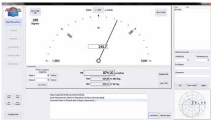
Screenshot of live indicator reading as analog meter with synchronized rotary encoder position; step-by-step instructions for part and probe set up; and T.I.R. results table.